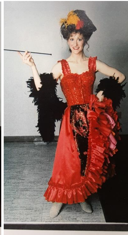
VALENCIENNE ACT III