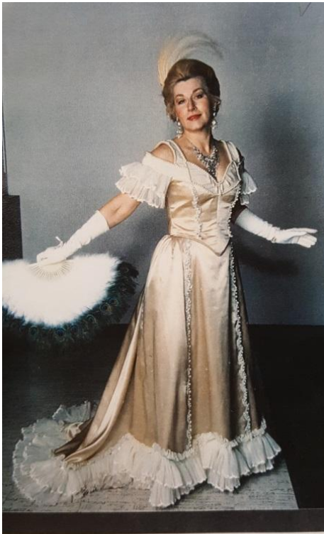
ANNA ACT III