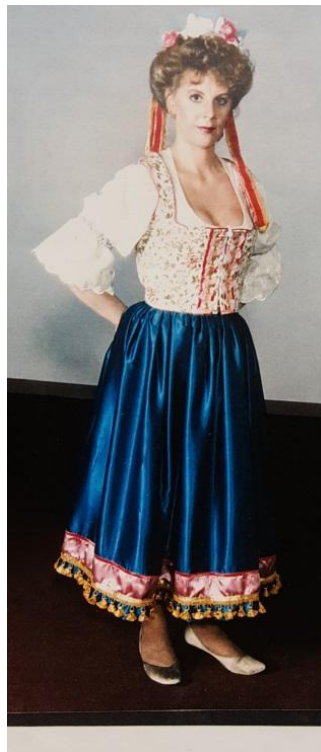
VALENCIENNE ACT II