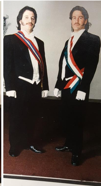
St. Brioche, Cascada