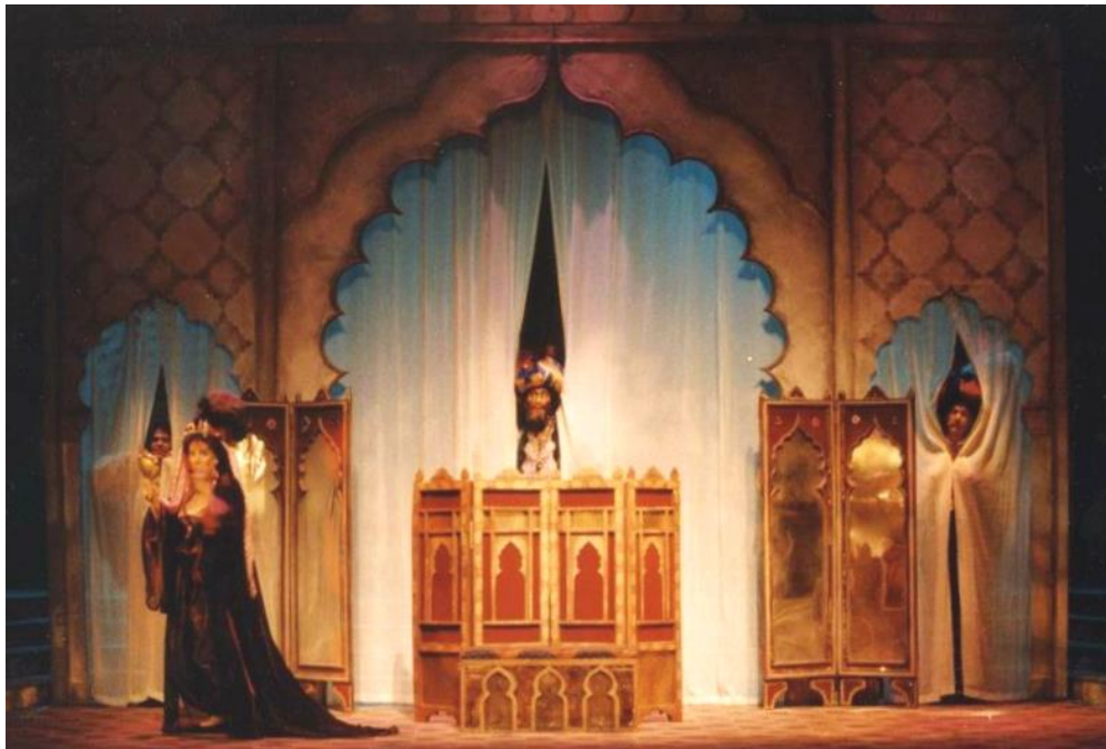
Act 2 - 2